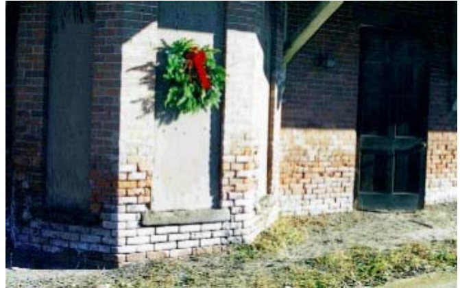
Windsor Locks Train Station December 2004