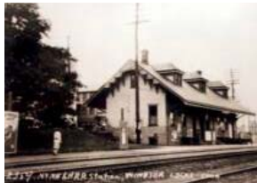
Windsor Locks Train Station circa 1920

All information is property of the Windsor Locks Preservation Association and may not be used without authorization from the Windsor Locks Preservation Association, Inc