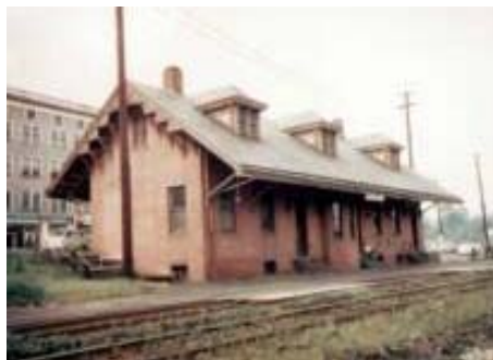
Windsor Locks Train Station circa 1967

YOU CAN HELP! Attend our public meetings, join our membership and attend fund raising events! Membership is only $10.00 yearly. We have many items available for your generous donation! Notecards $5.00, Cookbooks $10.00, Magnets $1.50, Prints $ 20.00 (unmatted) and Prints $25.00 (matted).